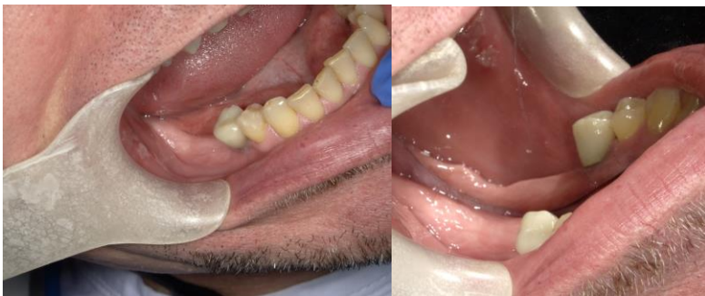
Site #30 C-h height, D2/D1 bone

He is also a founding member the North American Academy of Neural Therapy. He is also an active member and has lectured for the Minnesota Holistic Medical Group