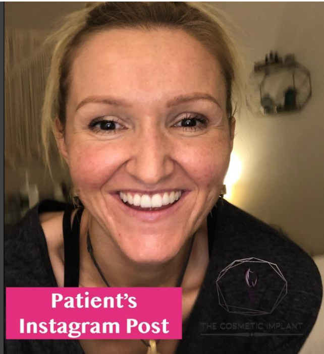
Patient's Instagram Post