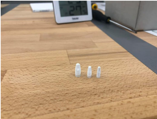
Fig.3: ZERAMEX XT ceramic dental implants: 10mm, 12 mm, 14 mm