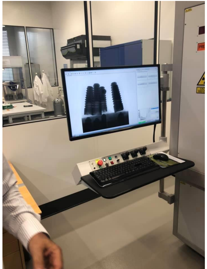
Fig.2: ZERAMEX XT Preview 2.0